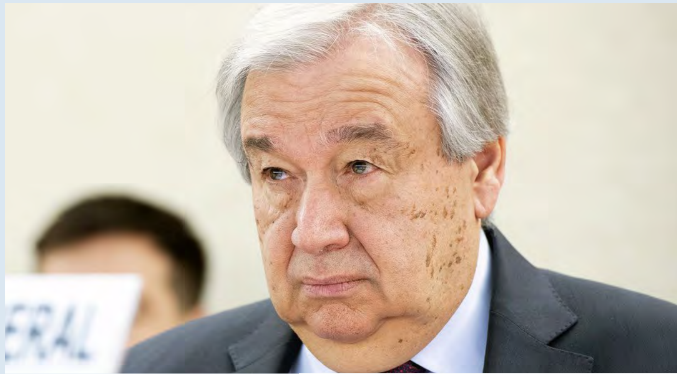
UN Secretary-General António Guterres attends the High Level Segment of the 43rd Regular Session of the Human Rights Council in Geneva.