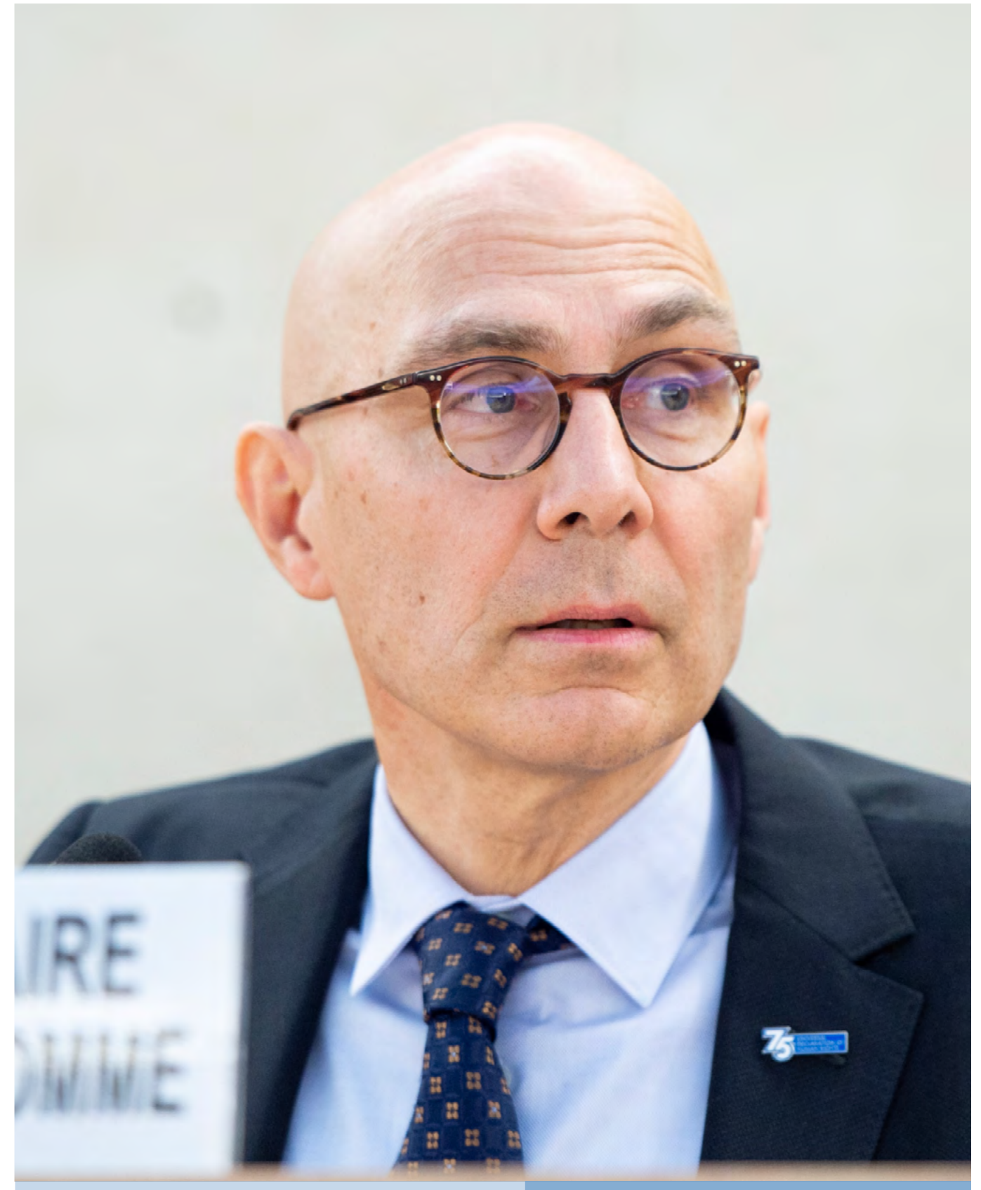
Volker Türk, United Nations High Commissioner for Human Rights addresses the 52nd Regular Session of the Human Rights Council, Geneva.