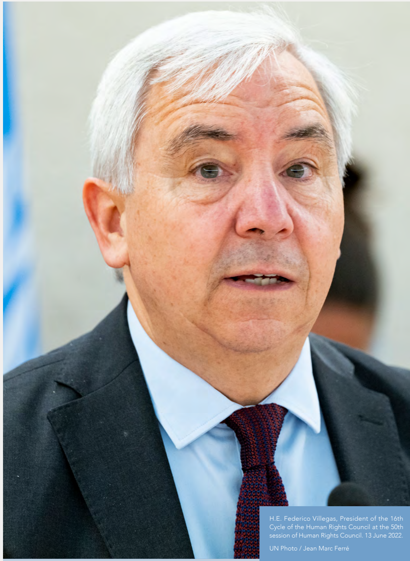
H.E. Federico Villegas, President of the 16th Cycle of the Human Rights Council at the 50th session of Human Rights Council, 13 June 2022.