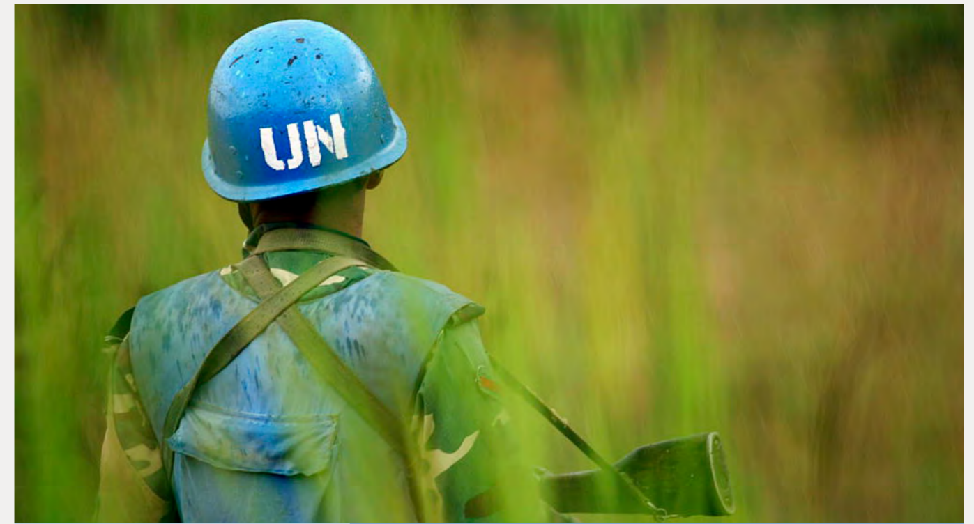
A United Nations Organization Mission in the Democratic Republic of the Congo (MONUC) peacekeeper is taking part in a training exercise, near Bunia in Ituri. 19/Oct/2006.