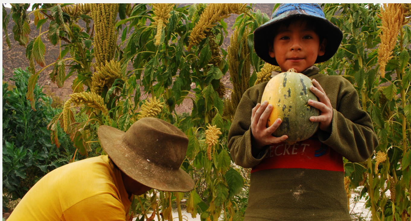
Children harvesting fruits in Juella, Quebrada de Humahuaca, Jujuy, Argentina. May 1 2010.

To provide for effective remedies, States should ensure that individuals have access to judicial and administrative procedures that meet basic requirements, including that the procedures: (a) are impartial, independent, affordable, transparent and fair; (b) review claims in a timely manner; (c) have the necessary expertise and resources; (d) incorporate a right of appeal to a higher body; and (e) issue binding decisions, including for interim measures, compensation, restitution and reparation, as necessary to provide effective remedies for violations. The procedures should be available for claims of imminent and foreseeable as well as past and current violations. States should ensure that decisions are made public and that they are promptly and effectively enforced.