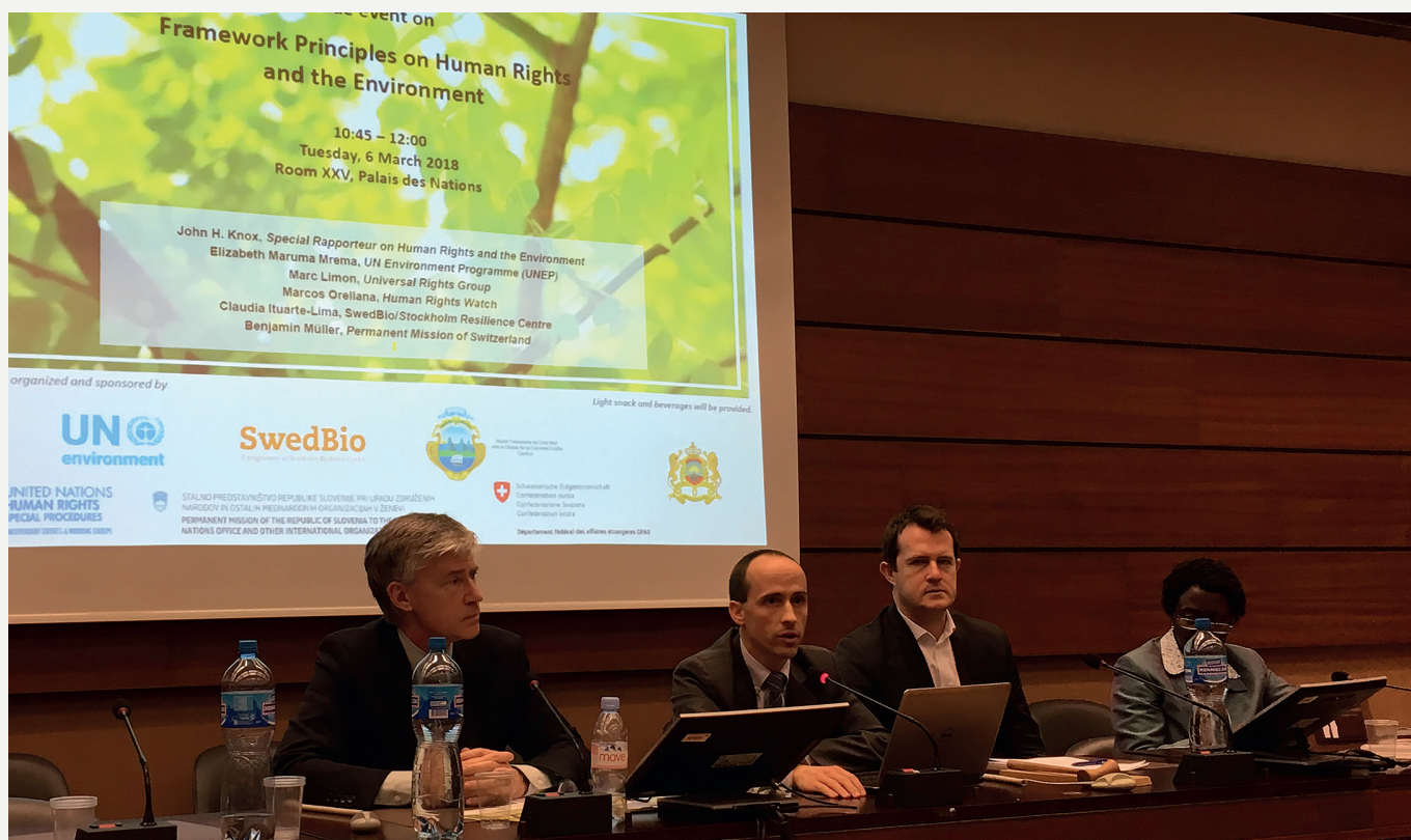
Side event during the 37th session of the Human Rights Council on Framework Principles of Human Rights and the Environment, March 2018, Geneva.