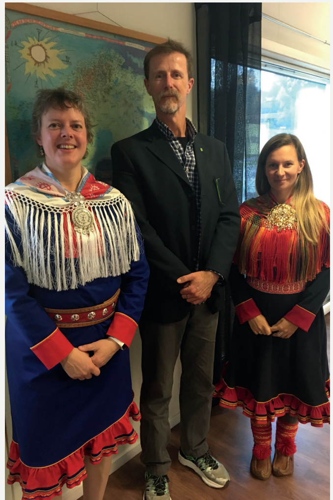
Official Mission of the Special Rapporteur on Human Rights and the Environment, professor David Boyd, to Norway, September 2019, Norway

A second, more sophisticated, empirical analysis of the effects of constitutional environmental rights on environmental performance, published in 2016, reached the same conclusion. 189 The study cross-referenced the presence of constitutional R2E provisions against environmental performance (using the 'Yale Center for Environmental Law and Policy's Environmental Performance Index'). It concluded that: 'Ultimately we find evidence that constitutions do indeed matter.' A third study, also from 2016, found constitutional recognition of R2E to be positively correlated with equitable access to safe drinking water. 190