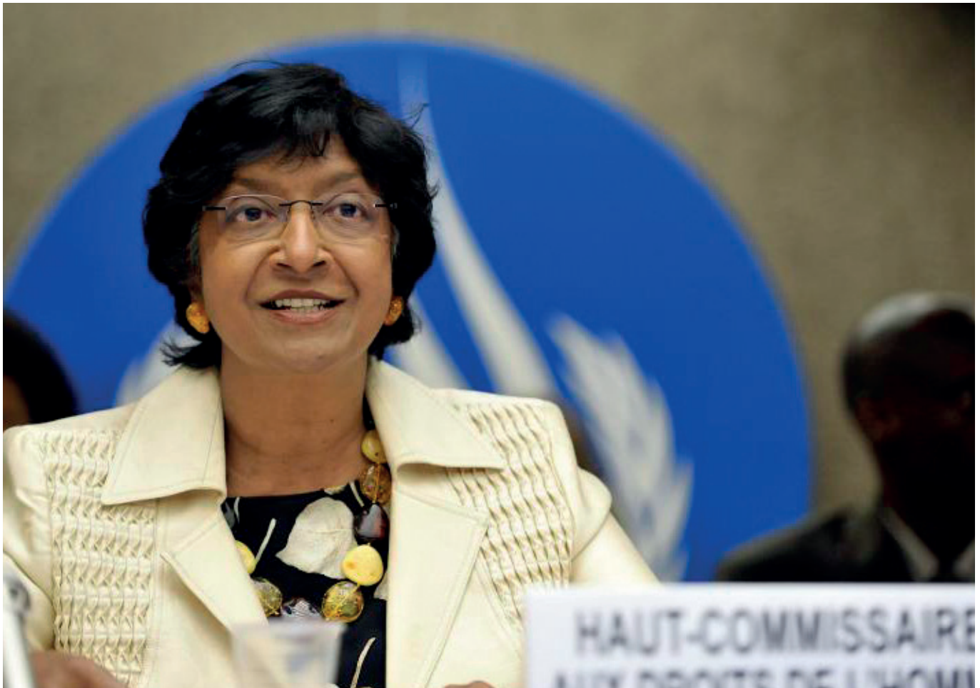
High Commissioner for Human Rights Navanethem Pillay addressed the Council on Human Rights at the ninth session, September 2009, Geneva.

During the debate, no delegation argued with the notion that climate change has implications for a wide range of explicitly identified, internationally protected human rights; that already vulnerable ‘climate frontline’ countries are most at risk (and least able to adapt); and that the human rights impacts do not fall evenly across a given population, but rather disproportionately affect already marginalised or vulnerable groups, such as women and children. 29