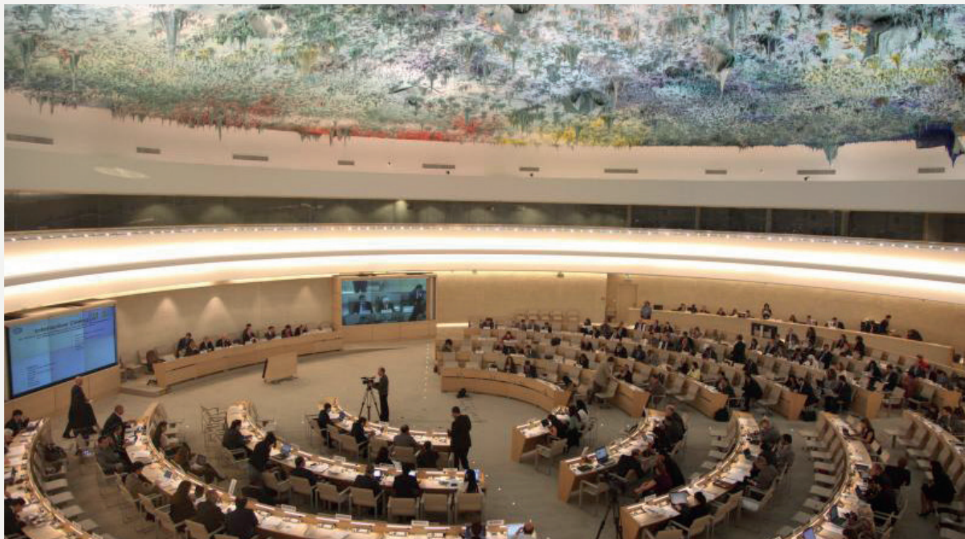
Human Rights Council, June 2010, Geneva.

With resolution 31/8, the Council called on or encouraged States to: