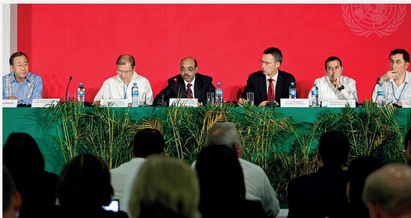
High-level Advisory Group on Climate Change Financing (AGF) during the UN Conference on Climate Change (COP16) in Cancun, December 2010, Mexico.

Against this background, the Maldives approached Costa Rica and Switzerland, two of the three former main sponsors of the Commission's resolutions on human rights and the environment (Switzerland was also a member of the core group on human rights and climate change), to discuss their interest in restarting that initiative at the Council.