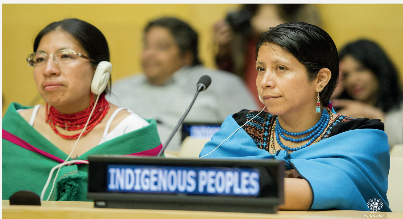
Event Marking International Day of the Indigenous Peoples, August 2016, New York.

First, States must recognise and protect the rights of indigenous peoples and traditional communities to the lands, territories and resources that they have traditionally owned, occupied or used,