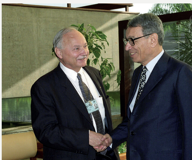
Former UN Secretary-General Boutros Boutros-Ghali and Secretary-General of the UN Conference on Environment and Development (UNCED) Maurice Strong, during the first day of UNCED, June 1992, Rio de Janeiro.

Why was this the case? As chapter III in this policy brief explains, many States have adopted a notably progressive position on human rights and the environment at the national level, even going so far as to recognise a constitutional right to a clean, safe, healthy and sustainable environment. Yet at the international level, despite some small steps forward such as the aforementioned Stockholm Declaration and, to a lesser extent, the 1992 Rio Declaration on Environment and Development, those same States would generally reject the notion that environmental harm had any implications for fundamental rights, or that promoting human rights norms could help protect against environmental damage.