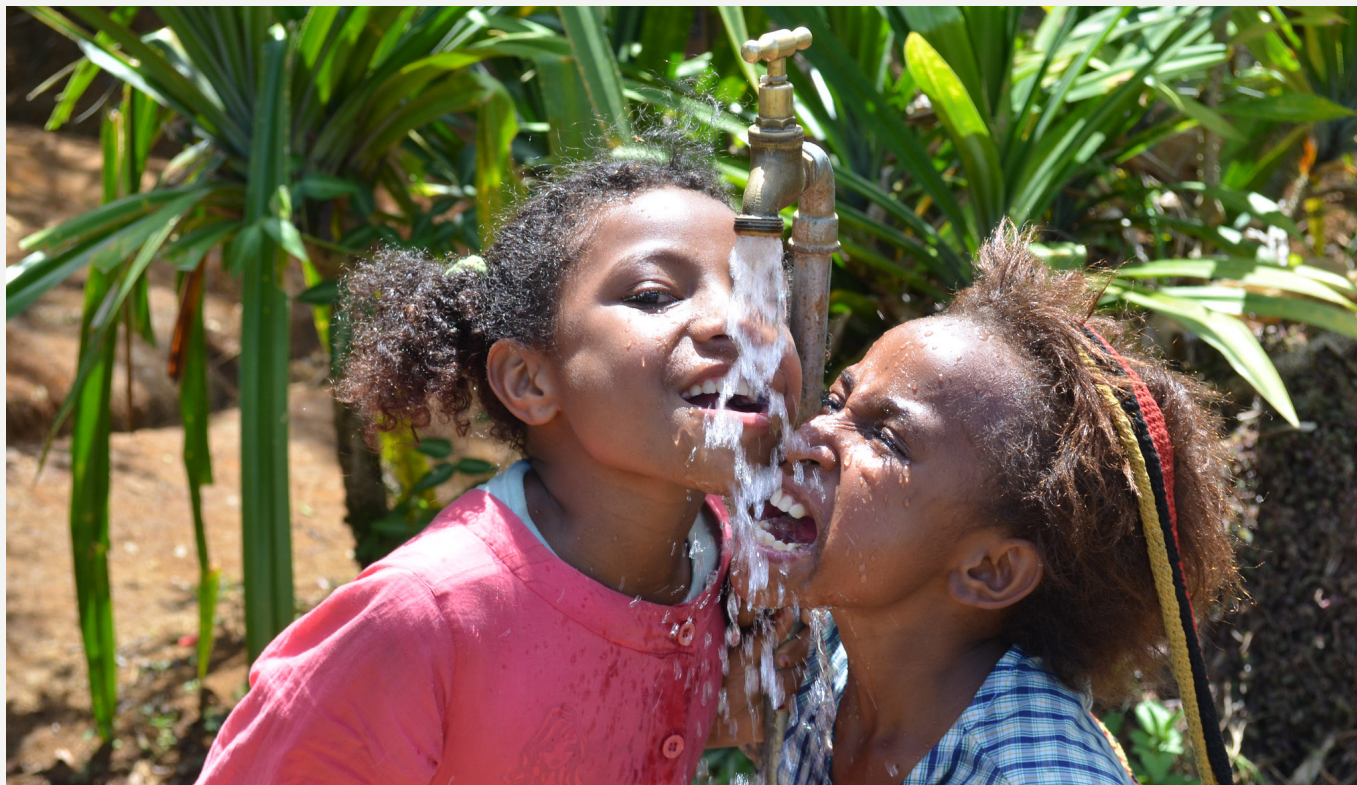
Children drink fresh water from a nearby water source, October 2010, Papua New Guinea.