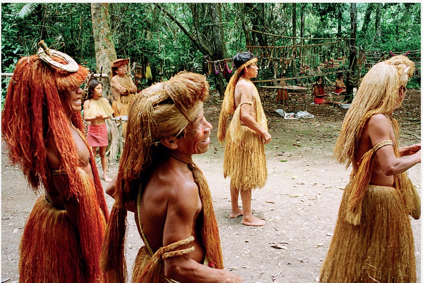
Members of the Yaguas tribe -who were relocated from the virgin jungle of the Amazon to a place near the city of Iquitos - strive to protect their culture and environment, amidst escalating threats to their survival, October 2018, Peru.

In developing and implementing international environmental agreements, States should include strategies and programmes to identify and protect those vulnerable to the threats addressed in the