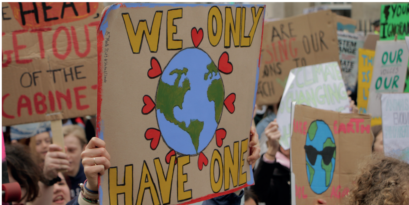
Young activists call for stronger environmental protection policies during the 2019 global climate strike, April 2019, London.

In September 2020, Costa Rica, the Maldives, Morocco, Slovenia and Switzerland delivered a joint statement at the 45th session of the Human Rights Council committing themselves to bring forward resolutions, in Geneva to the Council and in New York to the General Assembly, declaring universal recognition of the right to a safe, clean, healthy and sustainable environment.