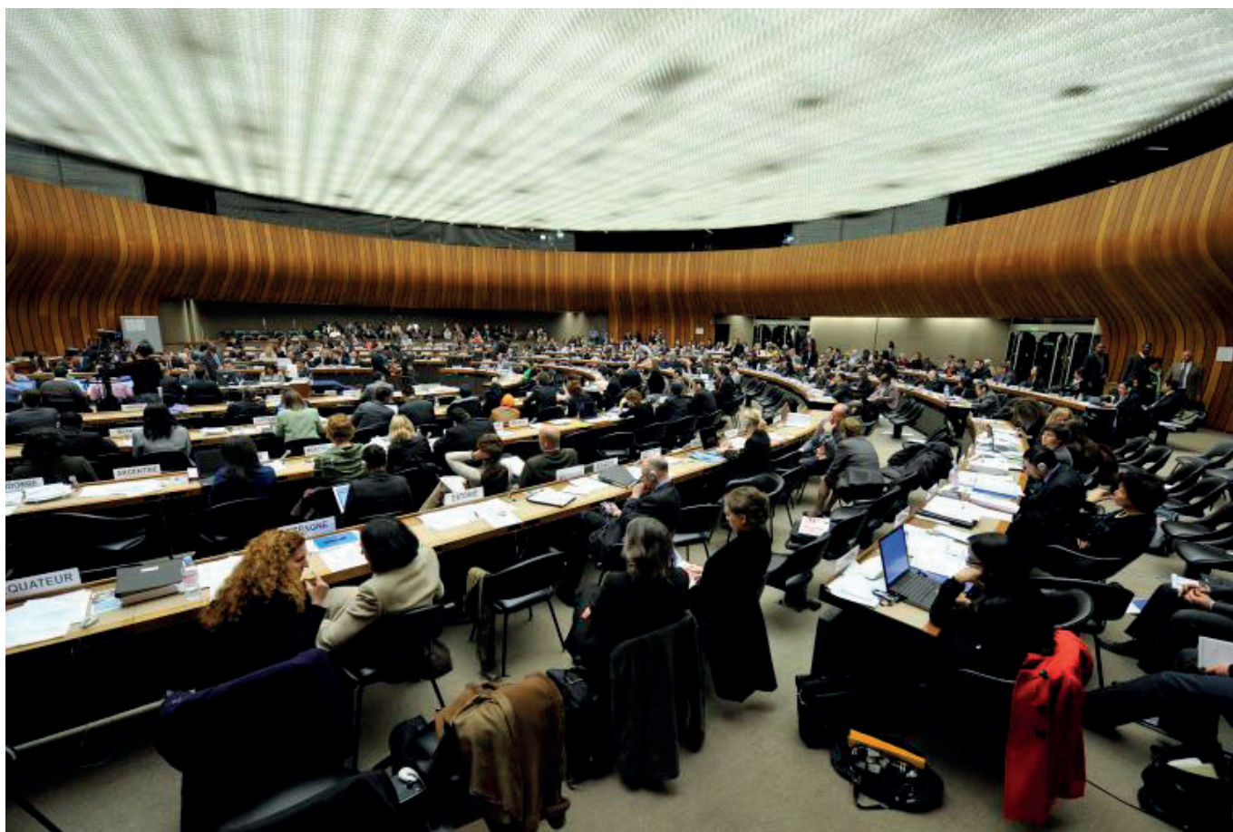
7th session of Human Rights Council, March 2008, Geneva.

between human rights and climate change first began to be drawn, at the intergovernmental level, during the seventh session of the Council in March 2008. Prompted by the Malé Declaration of November 2007, 14 a number of countries, including the Maldives and Philippines, noted the serious consequences of climate change for the full enjoyment of human rights and called on the Council to address the human rights dimension. Then, in March 2008, a core group of States, including Bangladesh, Germany, Ghana, Maldives, Philippines, Switzerland, UK, Uruguay and Zambia, secured the adoption by consensus of Council resolution 7/23 on ‘Human rights and climate change.’ 15