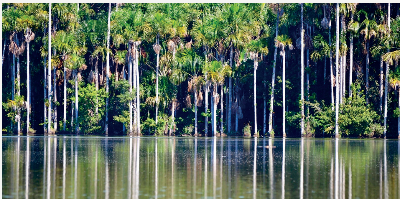
Tambopata National Reserve, one of the biggest protected areas of the Peruvian Amazon Rainforest, June 2013, Peru.