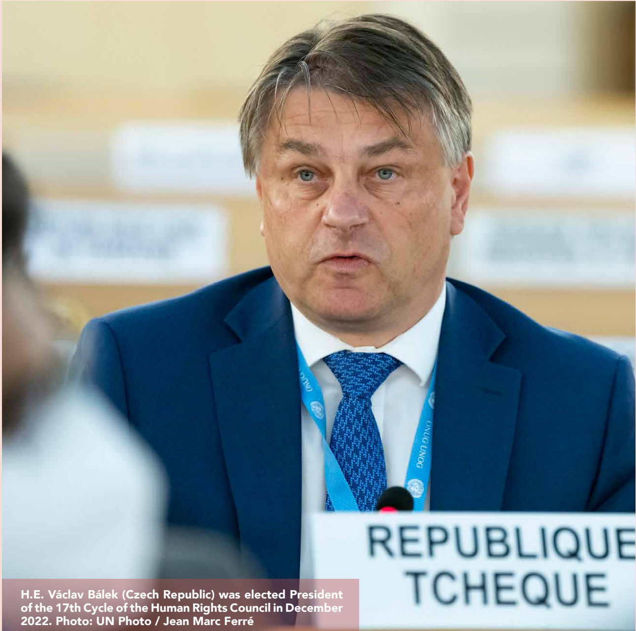
H.E. Václav Bálek (Czech Republic) was elected President of the 17th Cycle of the Human Rights Council in December 2022.