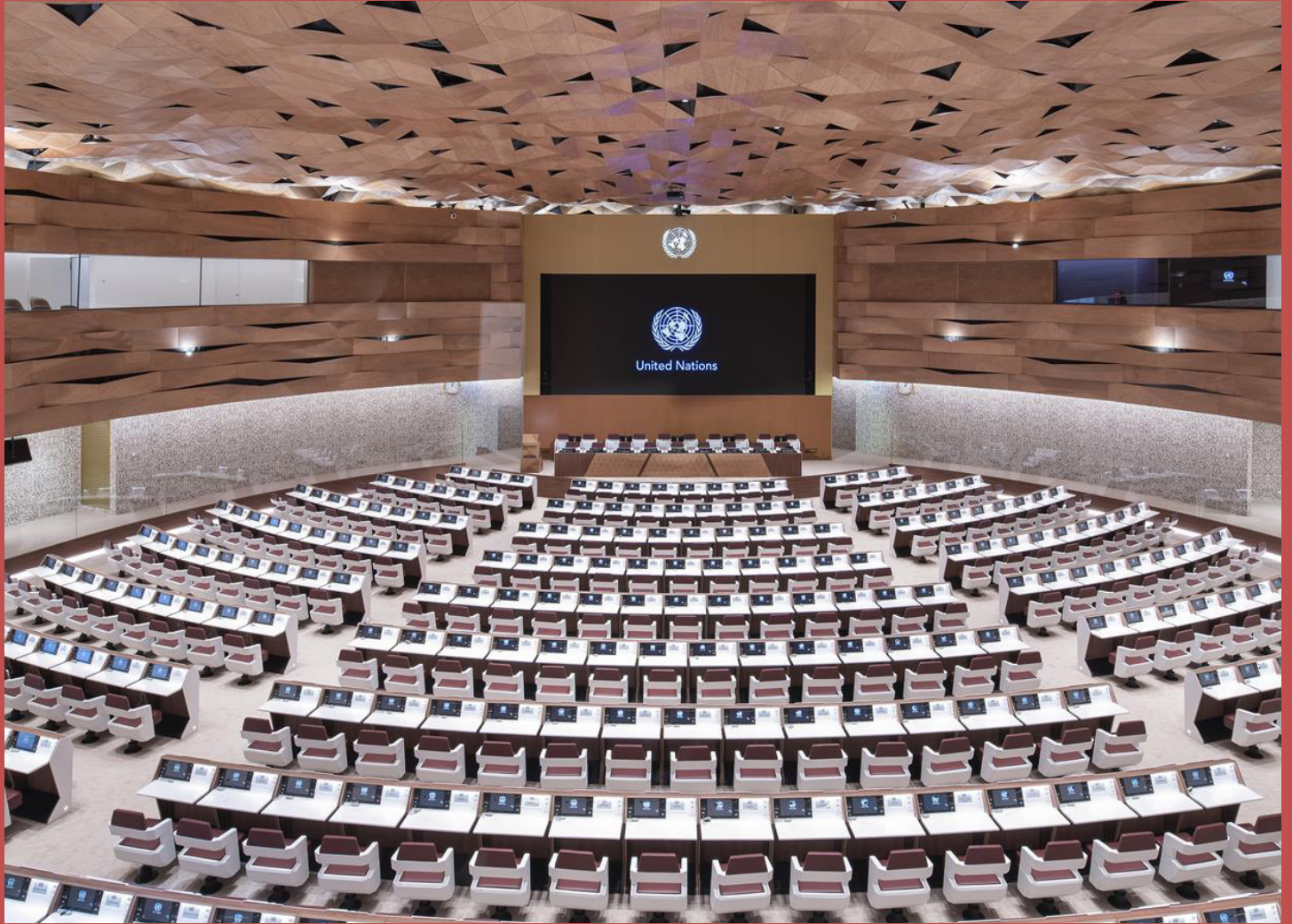
Room XIX at the Palais des Nations will function as the plenary meeting room during the 49th Session of the Human Rights Council.