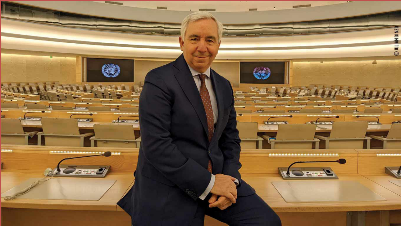
H.E. Federico Villegas, Permanent Representative of the Republic of Argentina, was elected as President of the Council for its 16th cycle on December 6th, 2021.