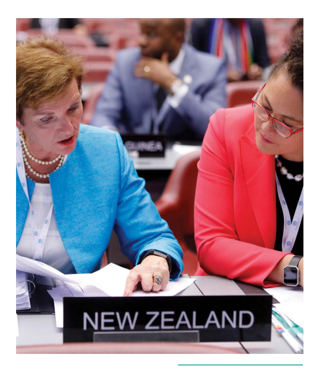
Meeting of the Committee on Democracy and Human Rights during the 138<sup>th</sup> Assembly of the IPU, Geneva, 2018

The vital role of parliaments in promoting respect for universal human rights norms has also been repeatedly recognised by the United Nations, especially by its Human Rights Council (the Council) and the General Assembly. For example, the Council has adopted four resolutions (resolutions 22/15, 26/29, 30/14, and 35/29) that acknowledge 'the crucial role that parliaments play in, inter alia, translating international commitments into national policies and laws and hence in contributing to the fulfilment by each State Member of the United Nations of its human rights obligations and commitments and to the strengthening of the rule of law,'<sup>13</sup> and which also recognise 'the leading role that parliaments could play in ensuring the implementation of recommendations made at the