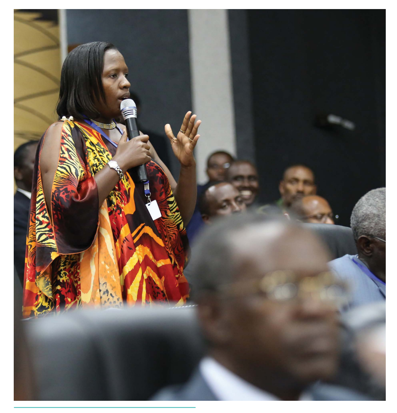
Umushyikirano National Dialogue, Rwandan Parliament, Kigali, 2015

The second, third and fourth points – on the establishment of human rights committees, the creation of networks for dialogue and cooperation, and the development of international principles – will be addressed in the following sections of this report.