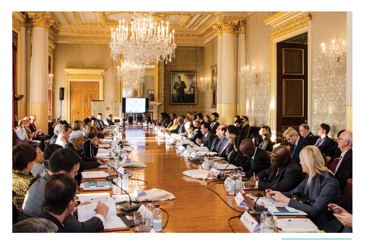
Commonwealth Parliamentary Conference on the Rule of Law and Human Rights, held in London, 24 – 26 January 2017

The present report seeks to map and analyse contemporary debates, decisions, and initiatives focused on parliamentary engagement with the